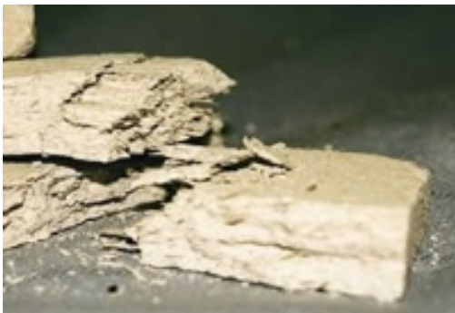
Pieces of AIB

Taunton Magistrates' Court heard today (31 March) that Da Vinci Developments Limited failed to plan for the potential presence of asbestos insulation board (AIB) before developing the property.