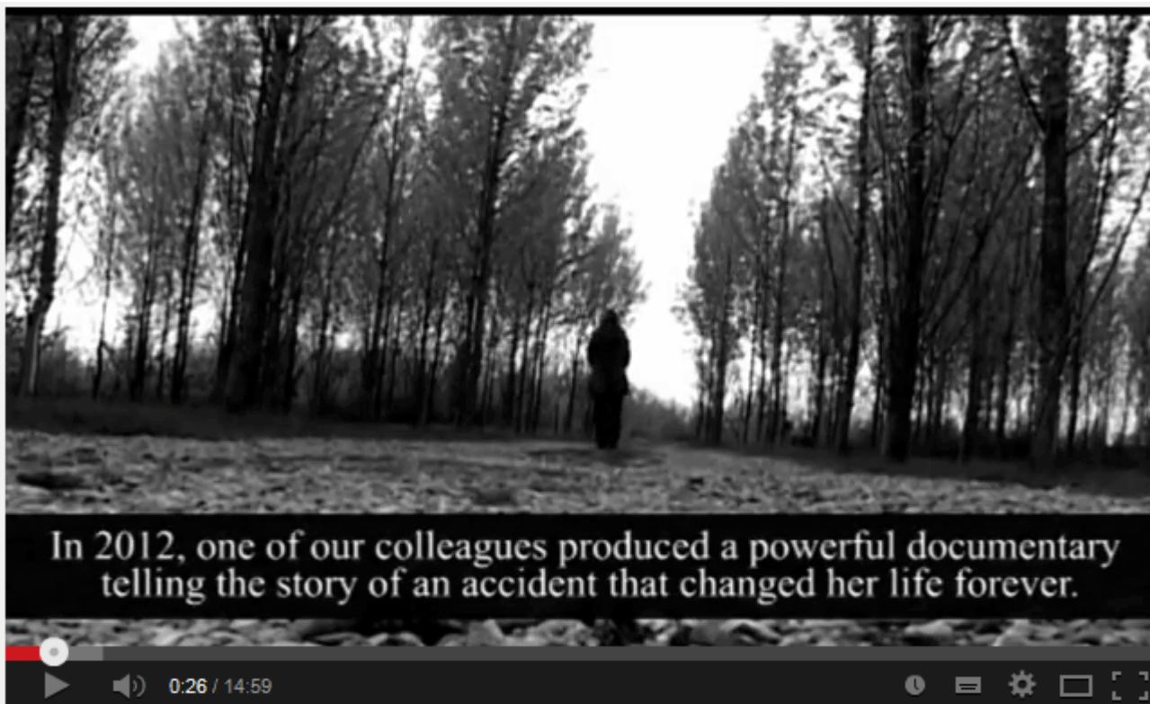
Kate's Story - A Safety Video

This film was made to share with other professionals, so they could be warned and learn that there is no such thing as 'no risk' just because you do it every day. Please take 14 minutes to see just how easy it is to make a fatal mistake in what should have been an everyday process; you won't regret it. It is a lesson we all need to take on board.